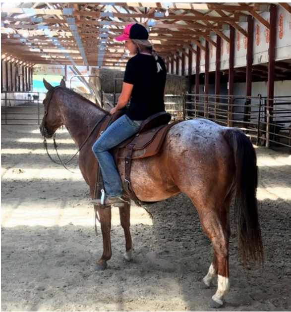
LOT 4 BSF PEPTOBOON 4992342 GELDING COLOR: Red Roan FOALED: 2007 BREED: QH OWNER: K. Langdeau