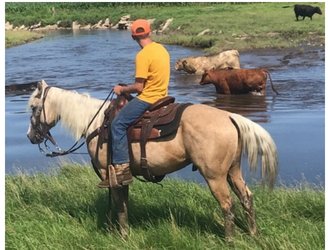
LOT 7 GRADE GELDING COLOR: Palomino FOALED: 2012 BREED: QH OWNER: D. Foster

"Elvis" is a 12 year old, gray gelding. I've used him for trail riding, giving kids rides, and sorting cattle. He's easy to bridle, saddle, mount, trim, and loads easily in trailer. He side passes, has great ground manners and a easy gait. He's used to the rope and has followed the hot heels and pulls a roping dummy. 14.3 hands. UTD on shots and trimming. Coggins.