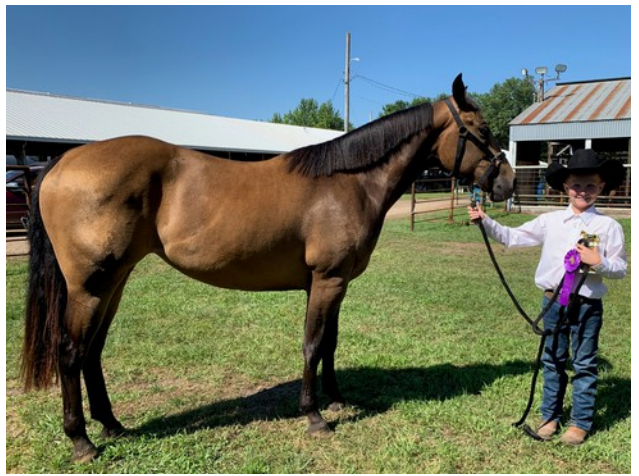
LOT 2 DARK ROSE BUCK 5829384 MARE COLOR: Buckskin FOALED: 2017 BREED: QH OWNER: T. Pedersen

All horses rode in the sale ring must be guaranteed sound by their owners or called otherwise in sale ring. You can buy with confidence at our long time reputation auction of over 30 years.