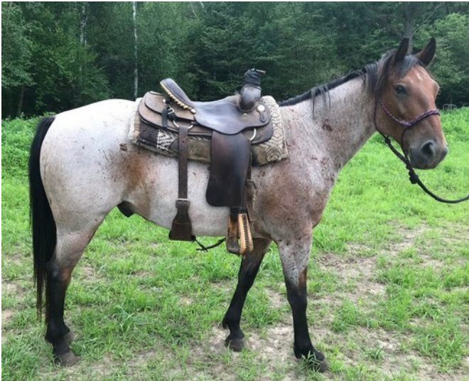
LOT 1 GRADE GELDING COLOR: Gray FOALED: 2010 BREED: QH OWNER: Hutch

Open Consignment Sale of Ride/Lead in horses ( Consignments accepted thru sale day)